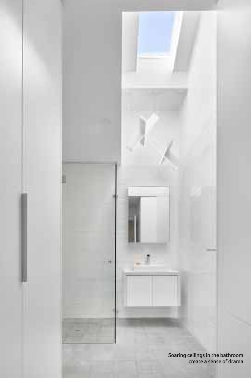
Soaring ceilings in the bathroom create a sense of drama