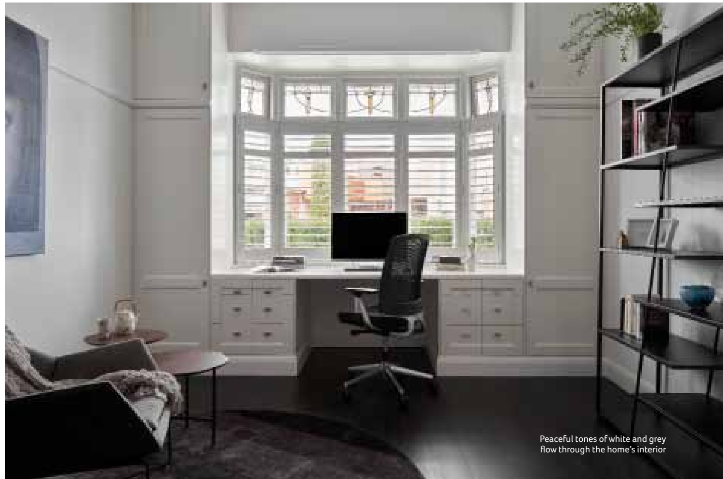
Peaceful tones of white and grey flow through the home's interior